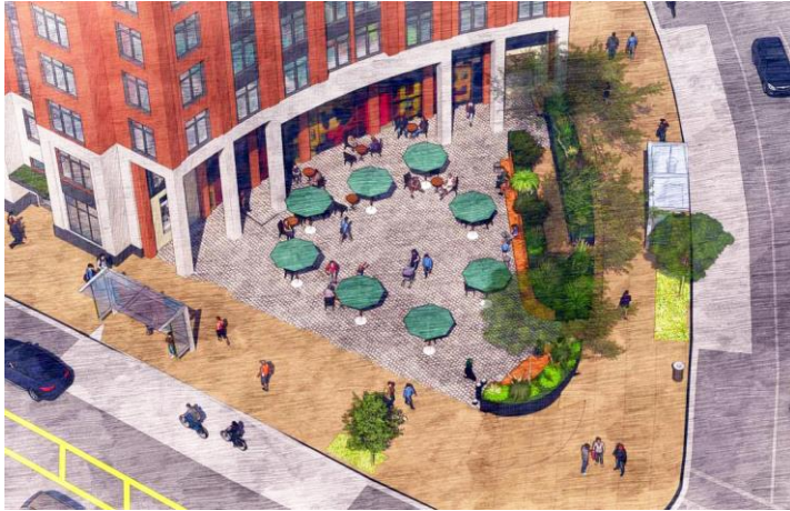
Proposed mixed use building with public plaza at 1800 Columbia, courtesy of Jubilee Housing and ECA Architects